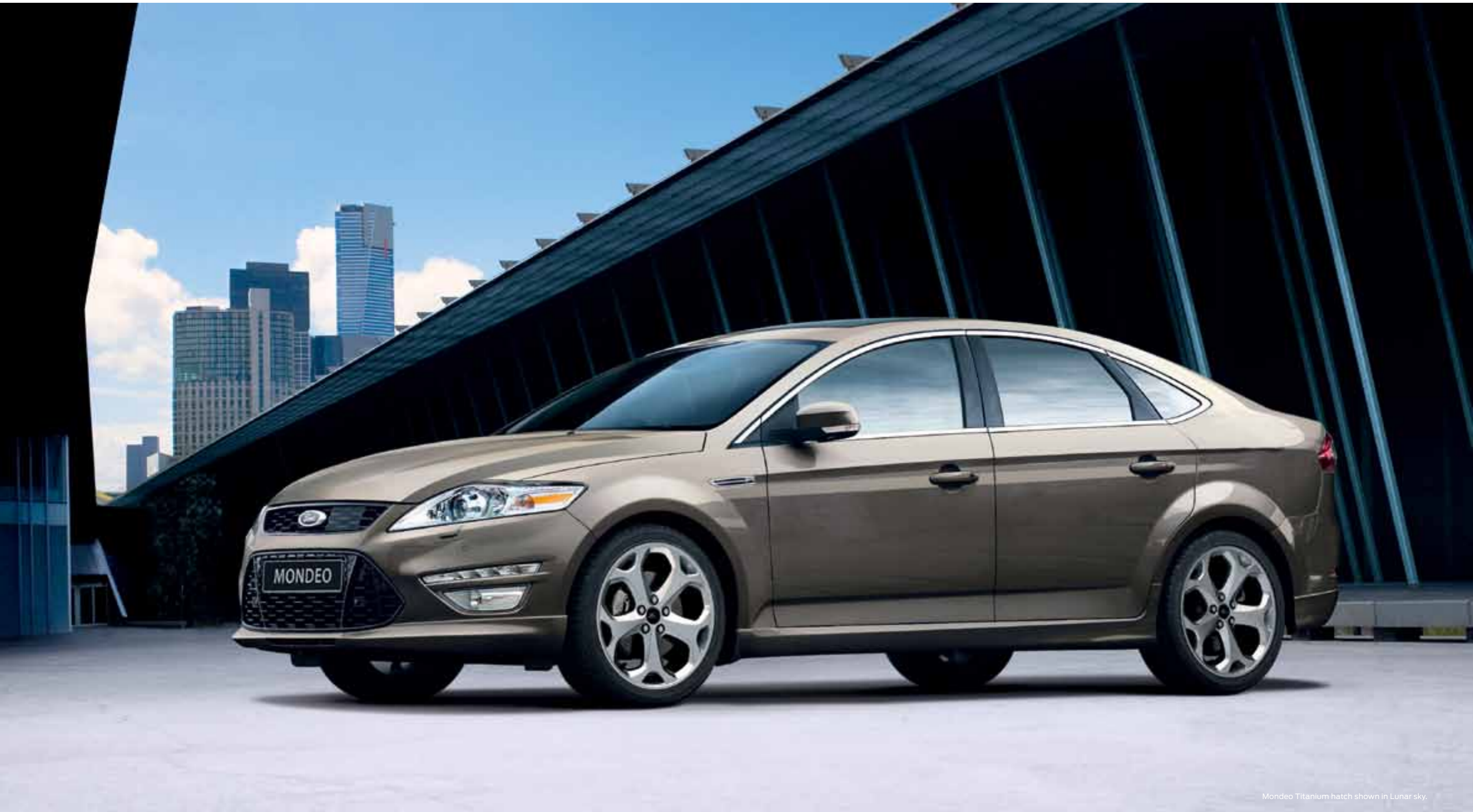
Mondeo Titanium hatch shown in Lunar sky.

Some designs are blessed with a unique talent to stand out from the pack. Introducing the new Ford Mondeo.