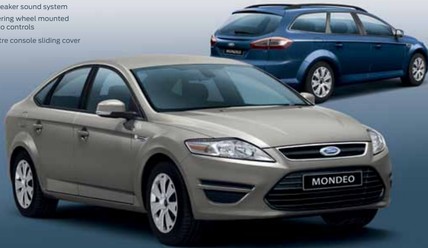
Sedan shown in Dark Mikastone, wagon shown in Ink Blue.