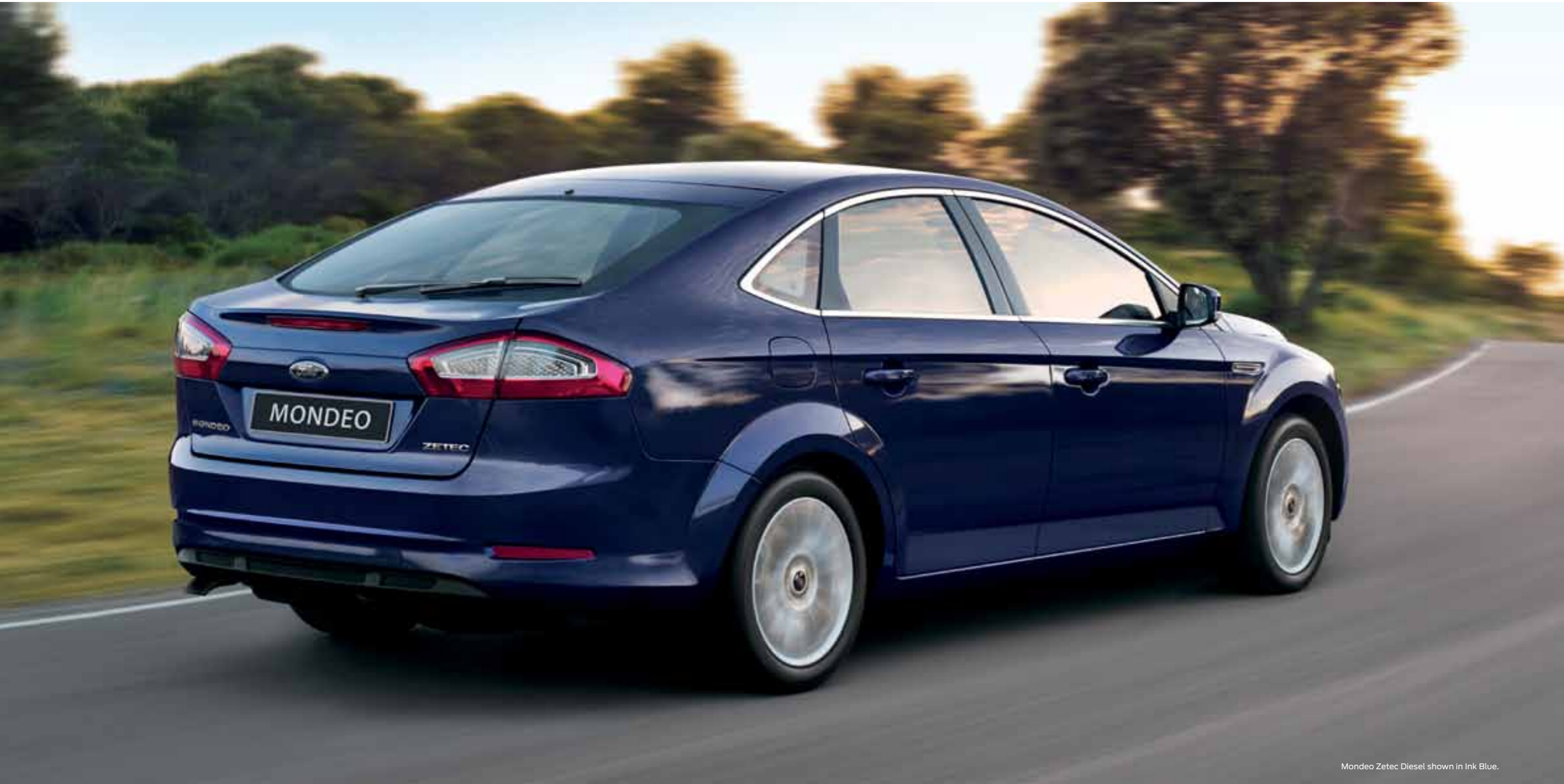
Mondeo Zetec Diesel shown in Ink Blue.

The Mondeo proves that a diesel can be as stylish and sporty as it is economical.