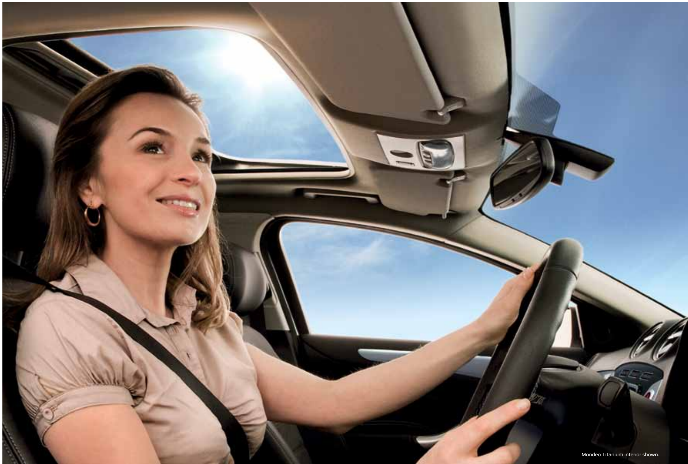
Mondeo Titanium interior shown.

Standard across the entire Mondeo range, imagine having a whole selection of your vehicle's functions and operations at your control simply by voicing a command. From controlling the vehicle's interior climate temperature to safely making hands-free calls on the move.