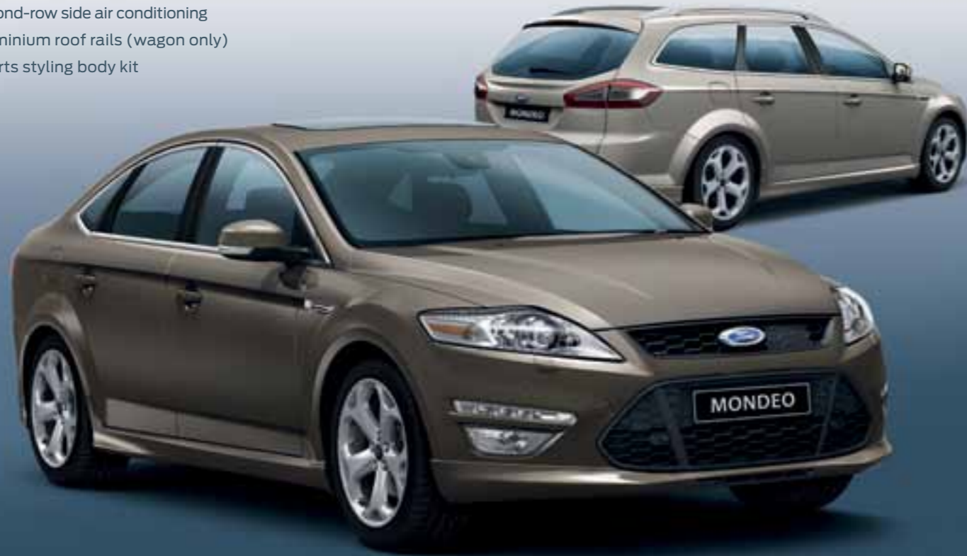
Sedan shown in Lunar Sky, wagon shown in Dark Mikastone.