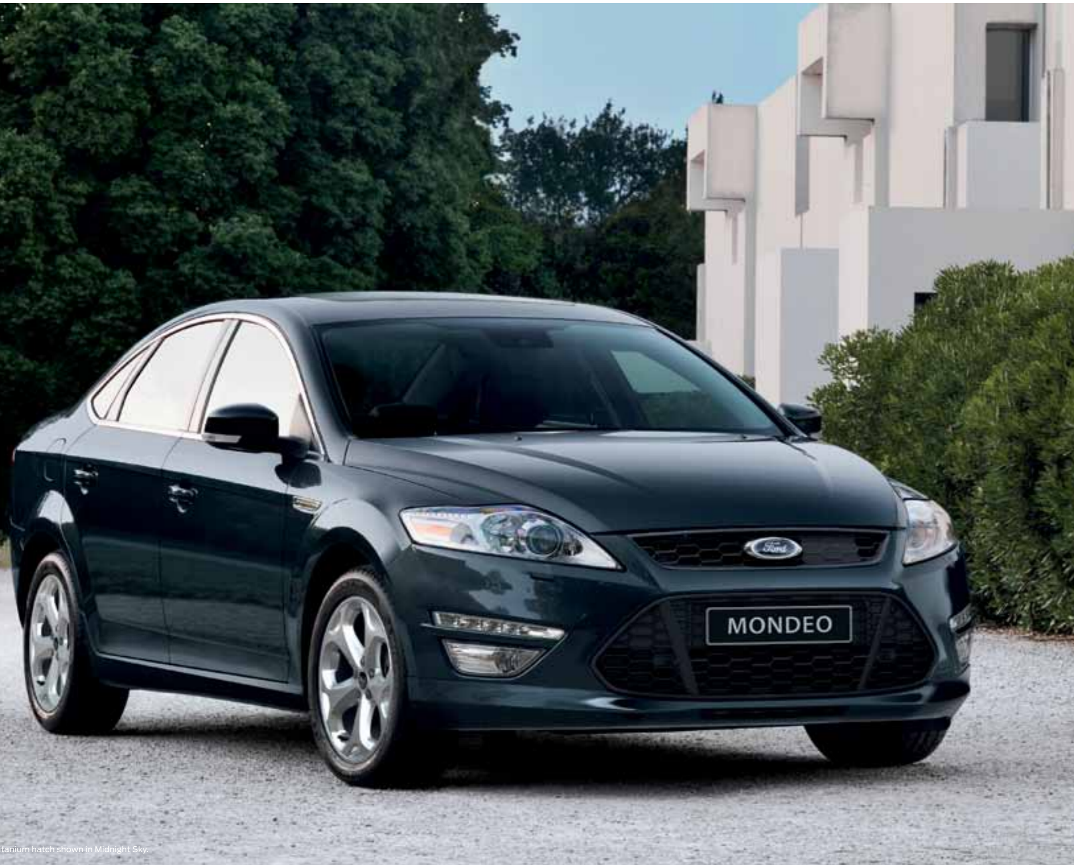
Mondeo Titanium hatch shown in Midnight Sky.

A great car is just the beginning. We support you with a wide range of services that aim to make you one of the most satisfied vehicle owners in Australia.