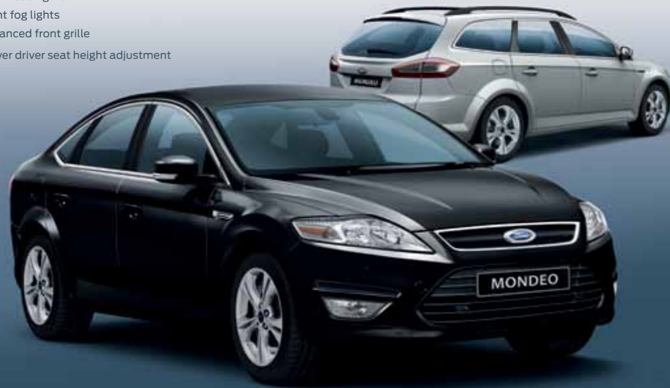
Sedan shown in Panther Black, wagon shown in Moondust Silver.