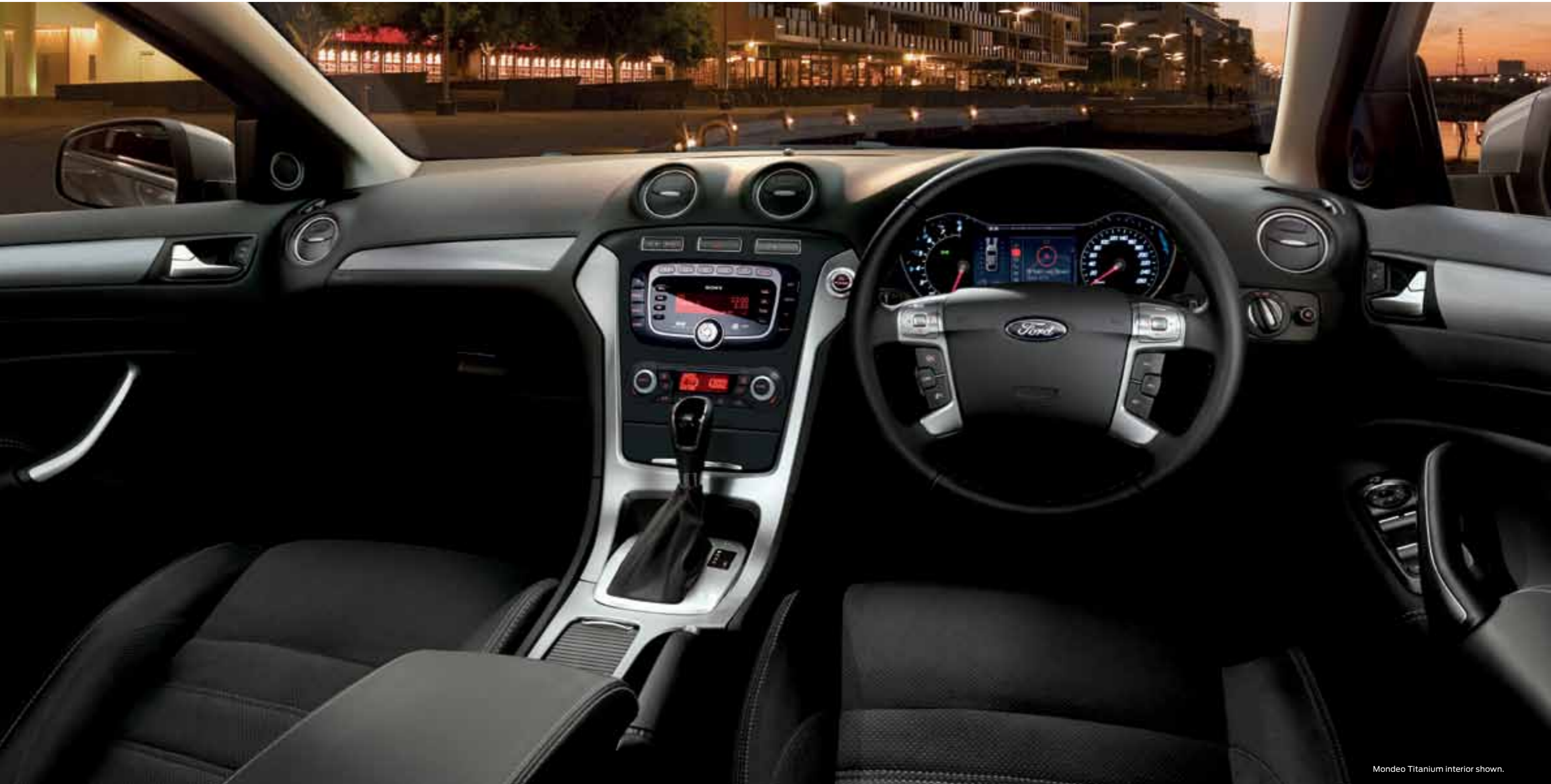
Mondeo Titanium interior shown.

A car that can detect when you're drowsy^ and that allows you to make phone calls without lifting your hands off the steering wheel are just some of the features that ensures your experience behind the wheel of the Mondeo is everything the exterior design promises.