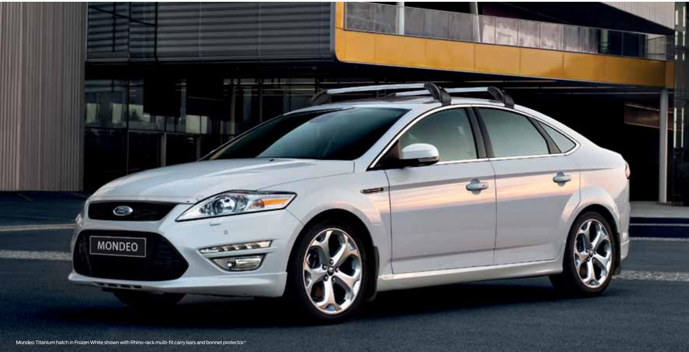
Mondeo Titanium hatch in Frozen White shown with Rhino-rack multi-fit carry bars and bonnet protector. 4

The Ford Vehicle Personalisation accessory range lets you personalise your Mondeo to perfectly suit your needs.