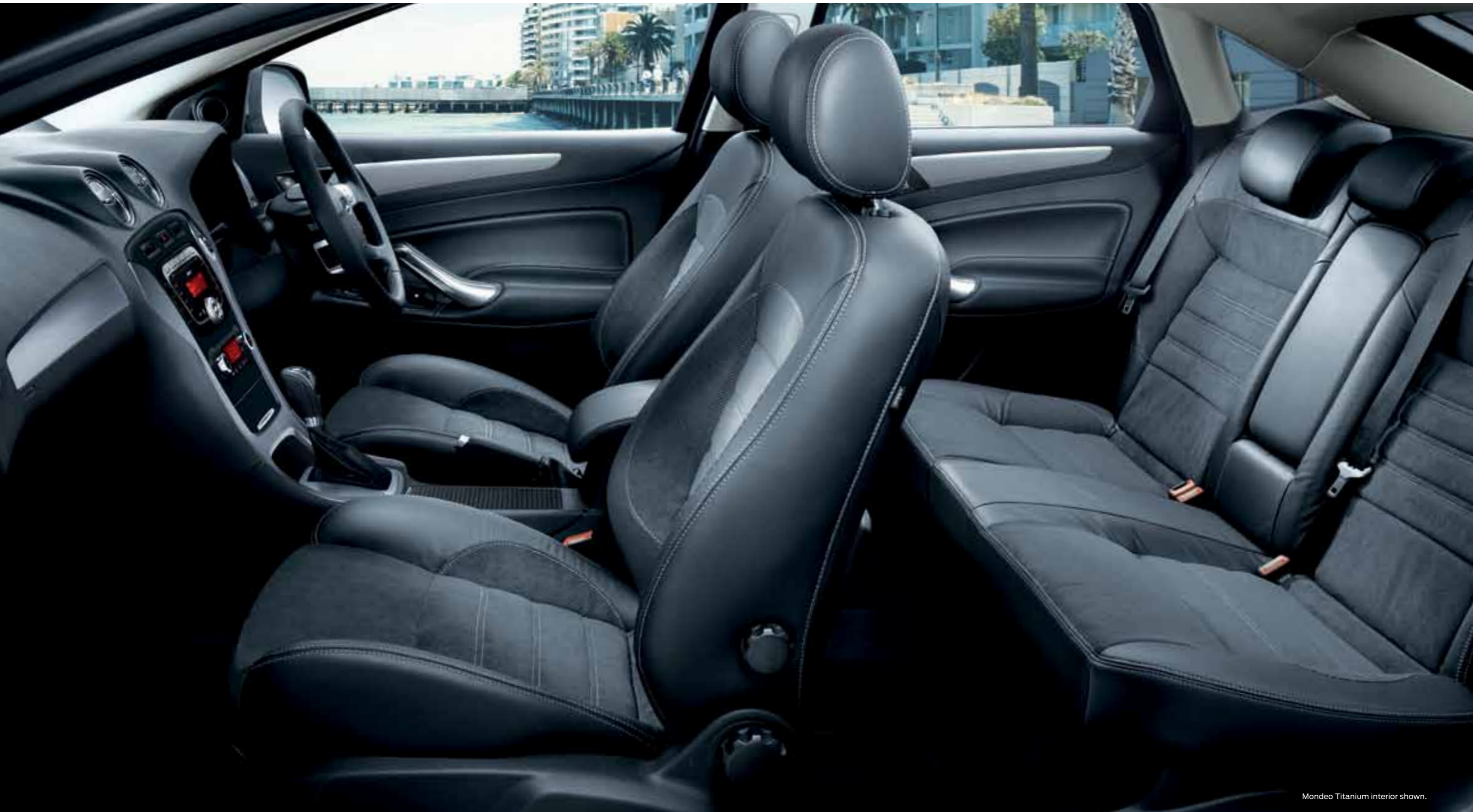
Mondeo Titanium interior shown.

Featuring Alcantara leather-trim seats, the Mondeo Titanium allows both driver and passengers to sit back and experience first class comfort and luxury.