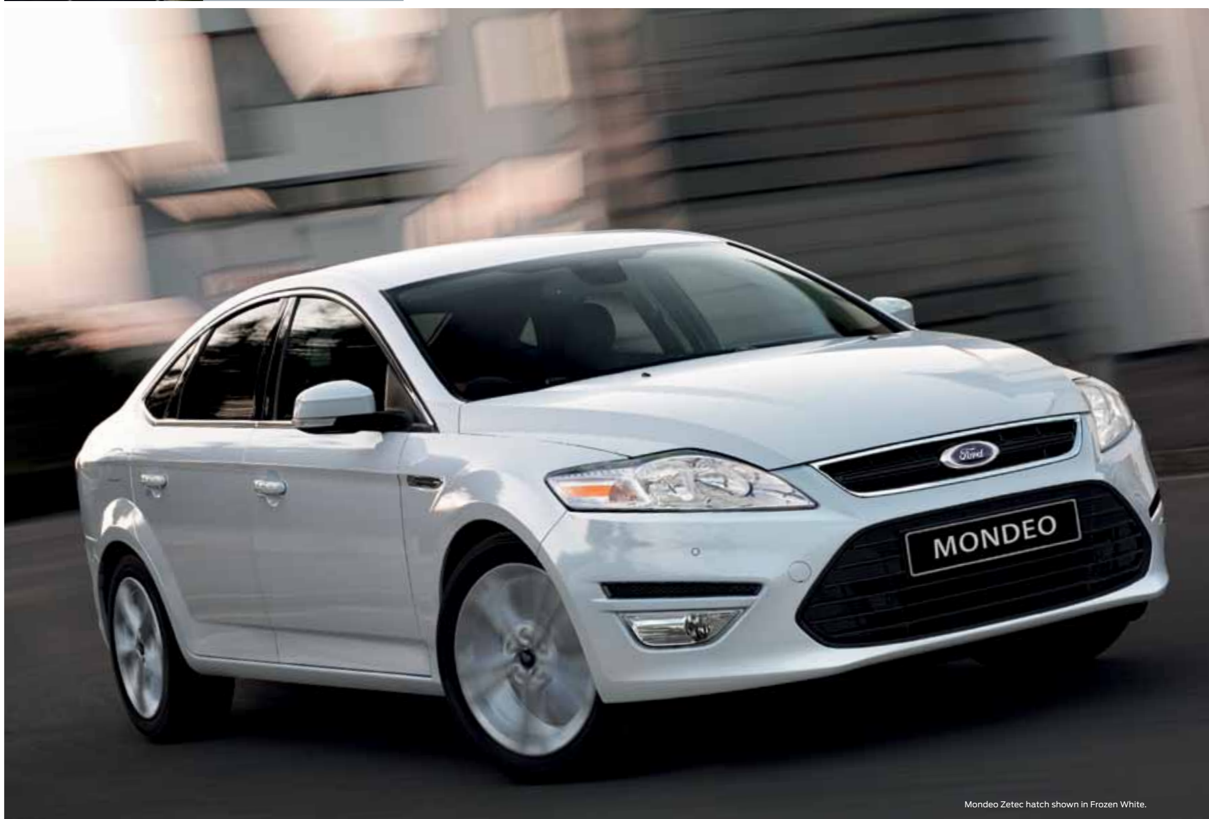
Mondeo Zetec hatch shown in Frozen White.

Front wipers that automatically turn on when it begins to rain. A sensor on the front windscreen detects if and how much rain is falling, and based on your speed, the wipers automatically function to give you maximum visibility.