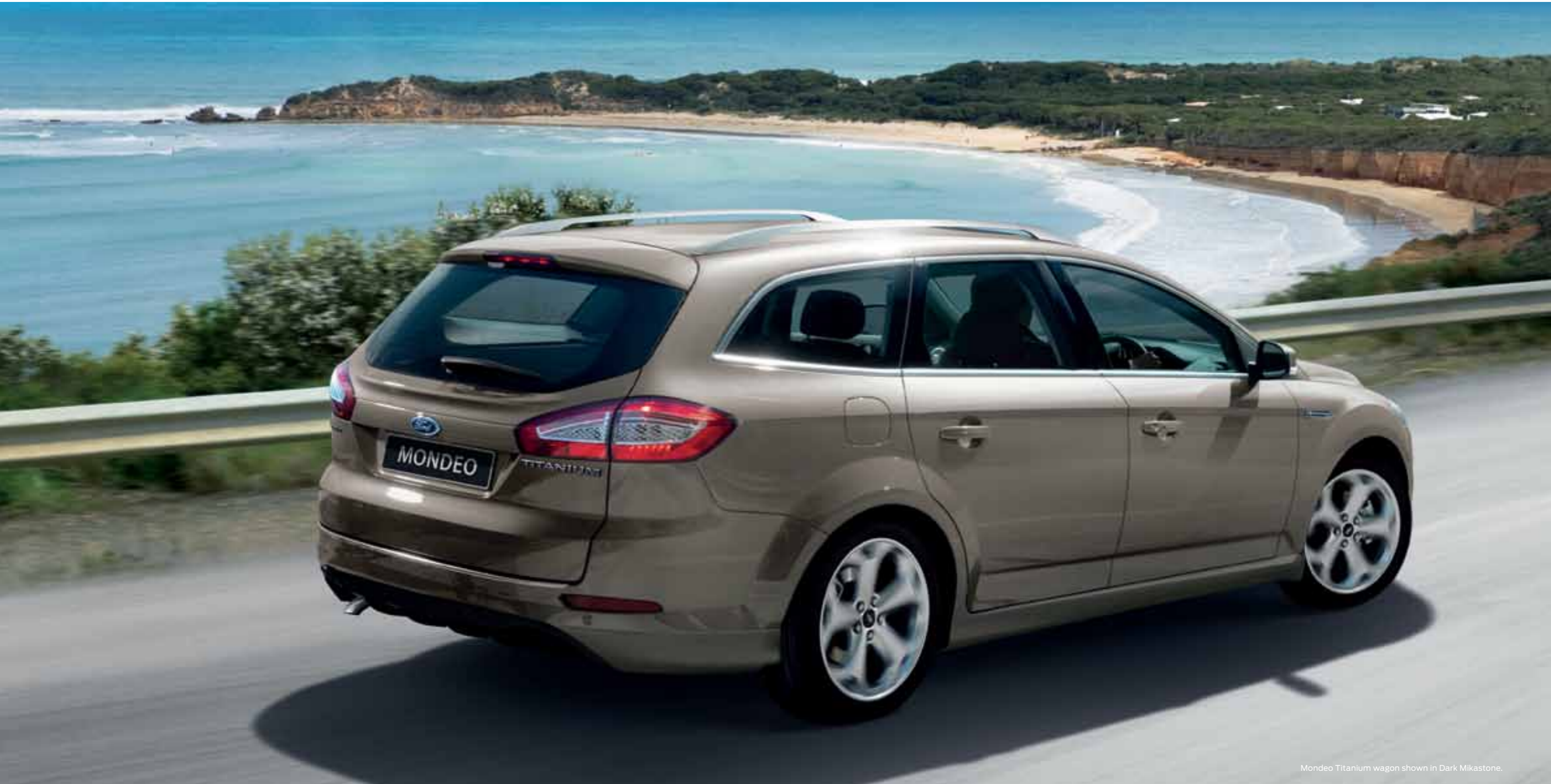
Mondeo Titanium wagon shown in Dark Mikastone.

For those who pack more into life you'll be pleased to know the Mondeo range gives you a vehicle that gives you the flexibility to pack more of whatever you need.